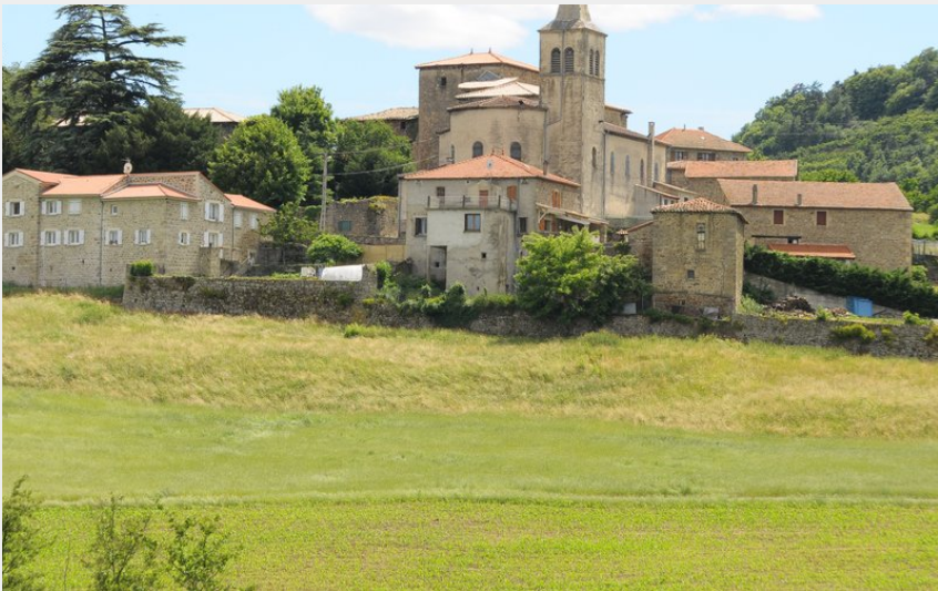
Vue du village