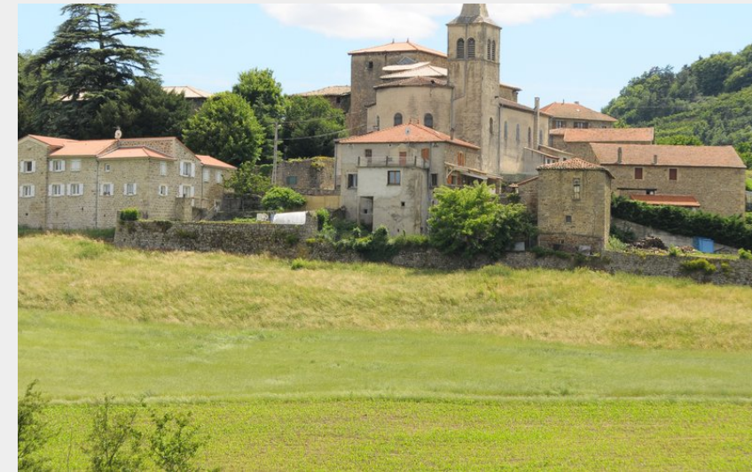
Vue du village (Ardèche Hermitage Tourisme)