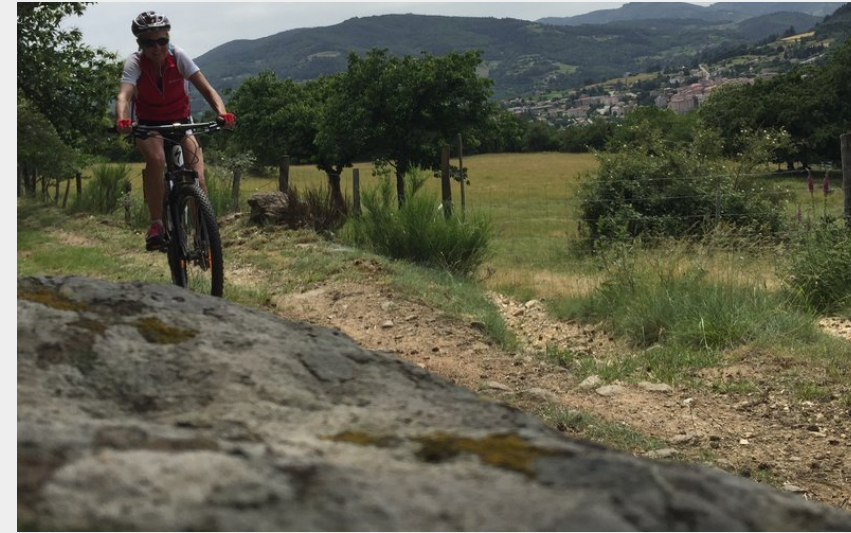
Passage à Montpeyroux (Ardèche Hermitage Tourisme)