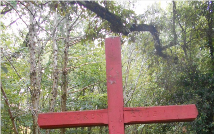
Croix Rouge (Alain Danel)