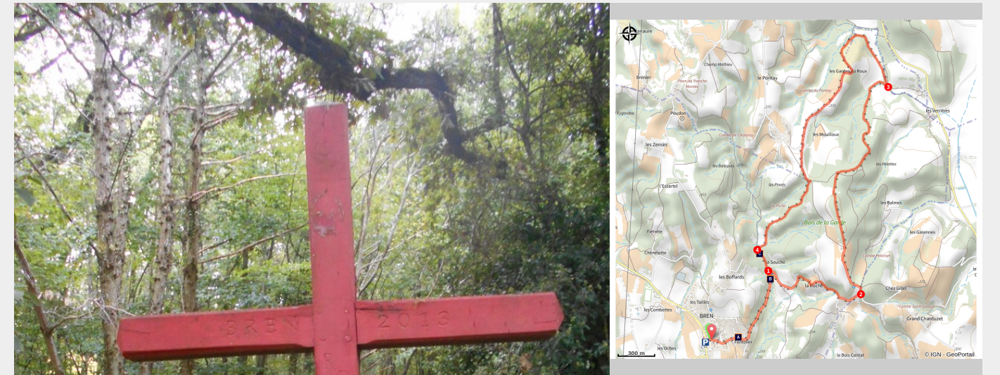
Croix Rouge (Alain Danel)