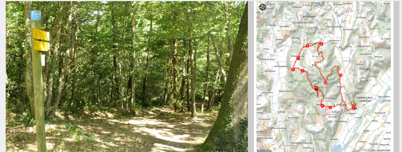
Sentier forestier (Ardèche Hermitage Tourisme)

Wood and its forests are very important in our society today. Discover the many charms of this topic as you go along under shade on this pretty ramble.