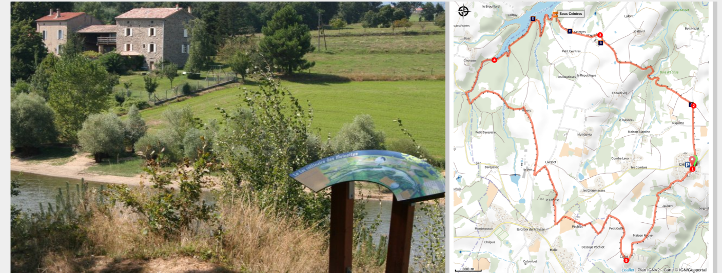
Panneau d'interprétation au bord du lac

A lovely walk through the village of Cheminas, focusing on the lac des Meinettes bathing in its green oasis.