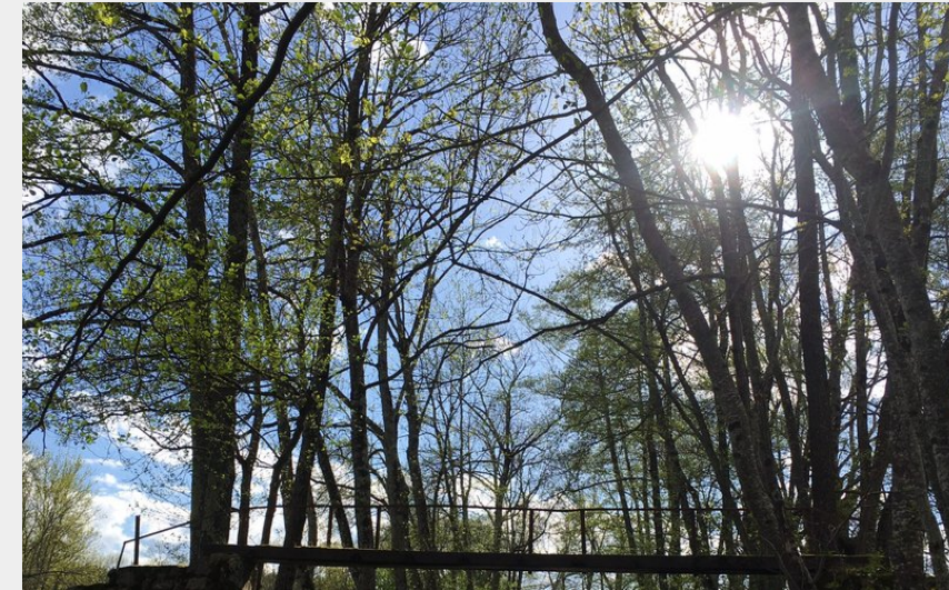
Passerelle de Turllet (Lydie Roudier)