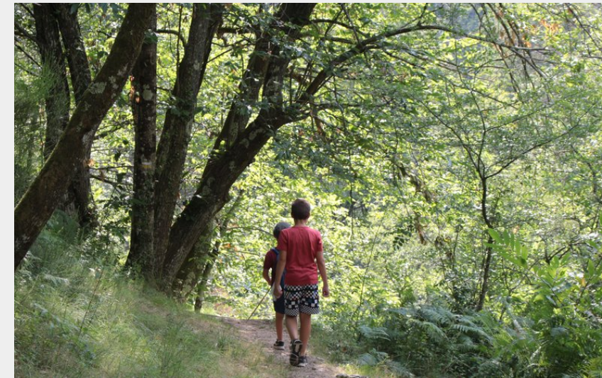
Abords de la Daronne (Ardèche Hermitage Tourisme)