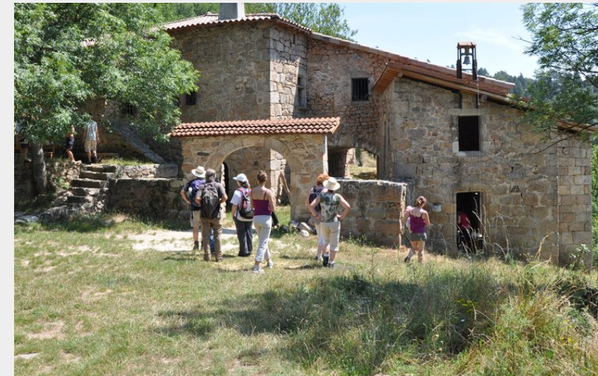
Chapelle de Saint Sorny (Ardèche Hermitage Tourisme)