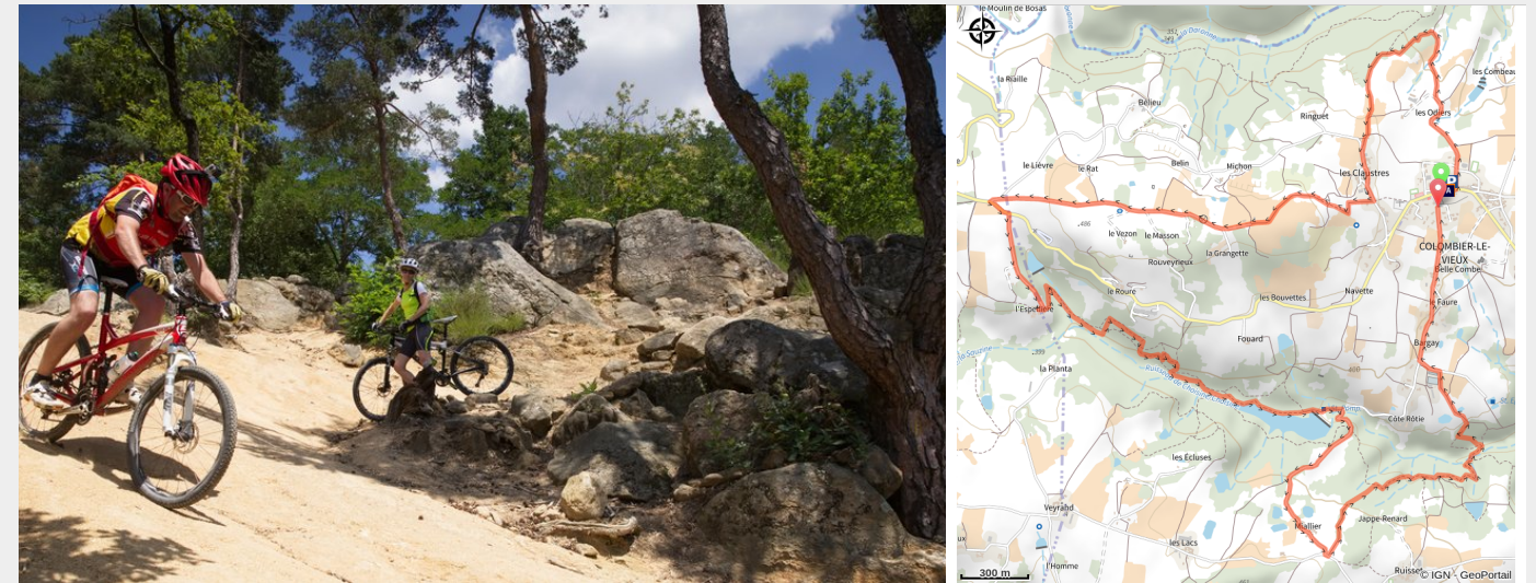
Passage technique du parcours (Ardèche Hermitage Tourisme)

The first part of the trail is quite easy-going with scenic views. It continues with very technical sections down into the dale of Choisine travelling past the catchment lake.