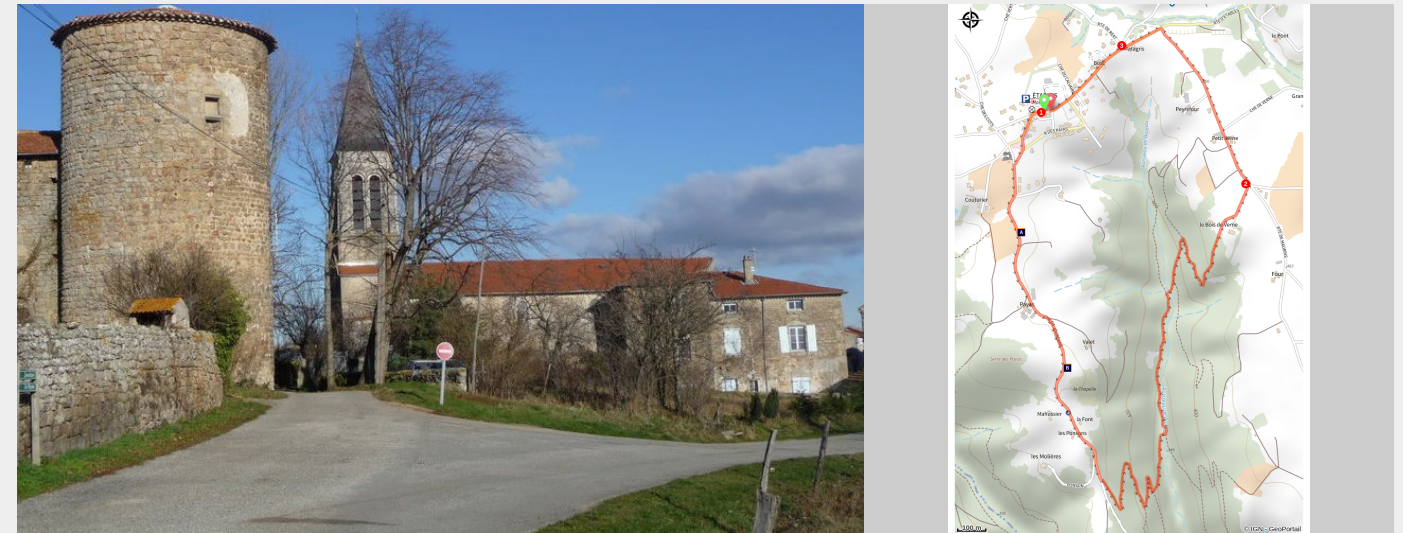
Village d'Étables (Ardèche Hermitage Tourisme)

An easy walk offering a magnificent panorama of the Vercors and Alps mountain ranges before taking you along the small, pretty and refreshing stream "Le Boras"