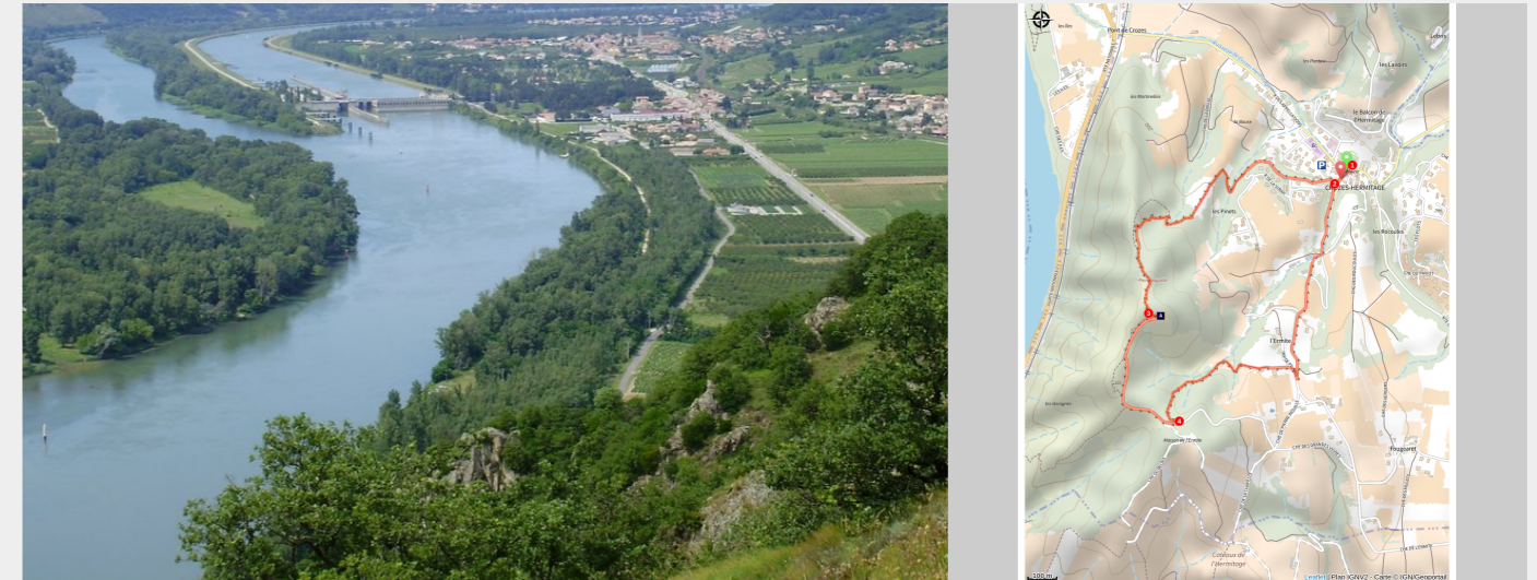
Vue du sommet

2 orientation tables with a splendid panorama.