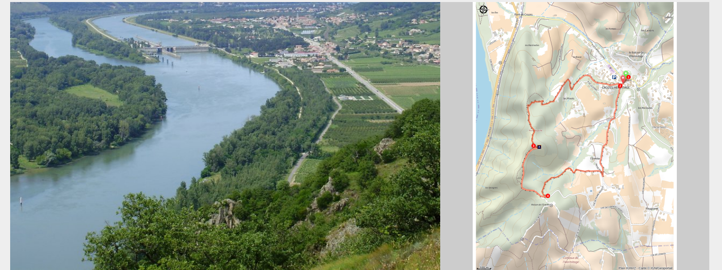
Vue du sommet

2 orientation tables with a splendid panorama.