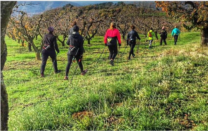
Randonnée hivernale