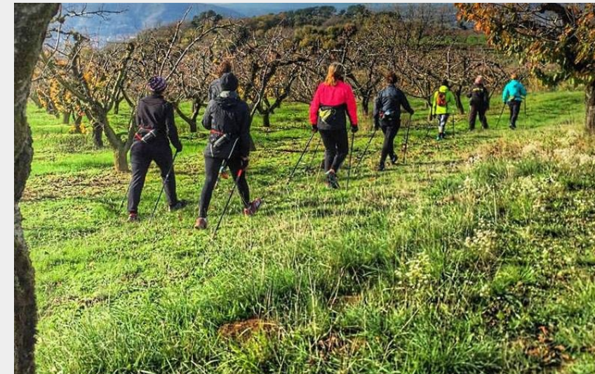
Randonnée hivernale