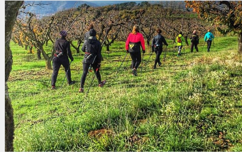
Randonnée hivernale