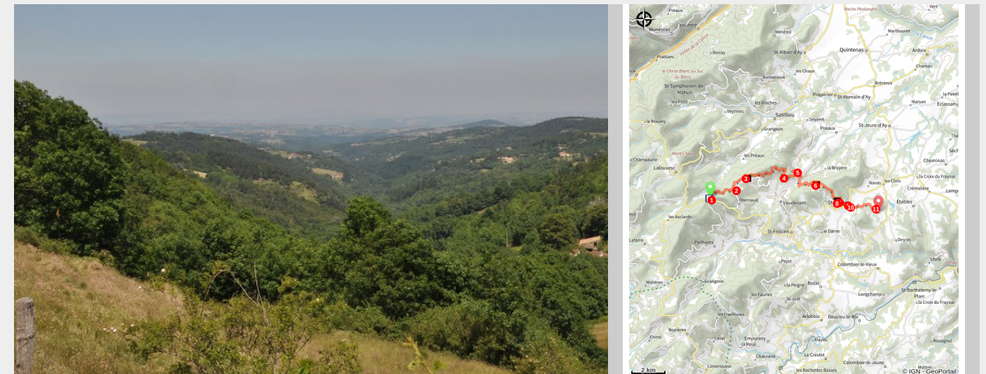
Vue du Col du Juvenet

Starting at the Col du Marchand follow the ridge between the Daronne Valley and Val d'Ay as far as the Col du Juvenet. Go up to Montplot with its amazing view then down to Corsas via Saint Victor.