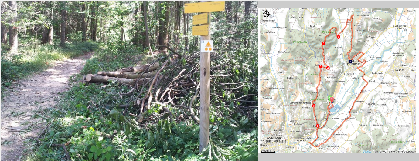
Sentier sur le parcours (Emmanuel Henry)

This very pleasant trail is fine for good beginners. However a few sections are rather technical. After the first uphill incline the track goes through woodland and then onto the first downhill slope. When you get to the bottom a succession of bends make it quite amusing. After the stock car circuit a fast and interesting path takes you up to the top of the hill then along the hillside. After the village, the return journey is a succession of wide paths back to Saint Donat.