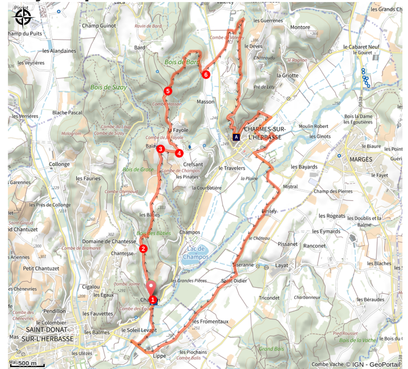
A The feudal château of Charmes (A)