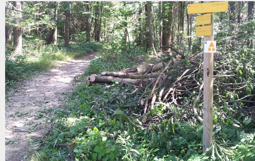
Sentier sur le parcours