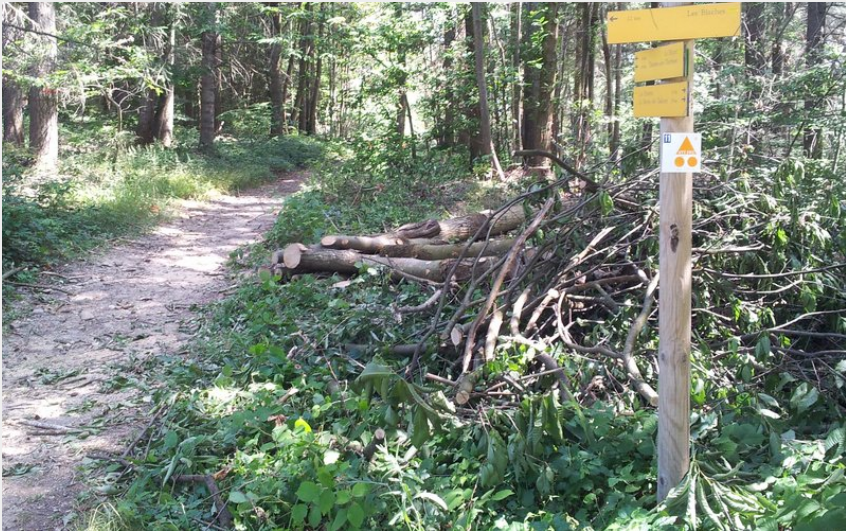
Sentier sur le parcours