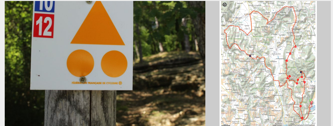
Balisage (Ardèche Hermitage Tourisme)

A very beautiful trail around the area of Herbasse with a dramatic change in scenery : rough and sandy along with a more mediterranean vegetation. .