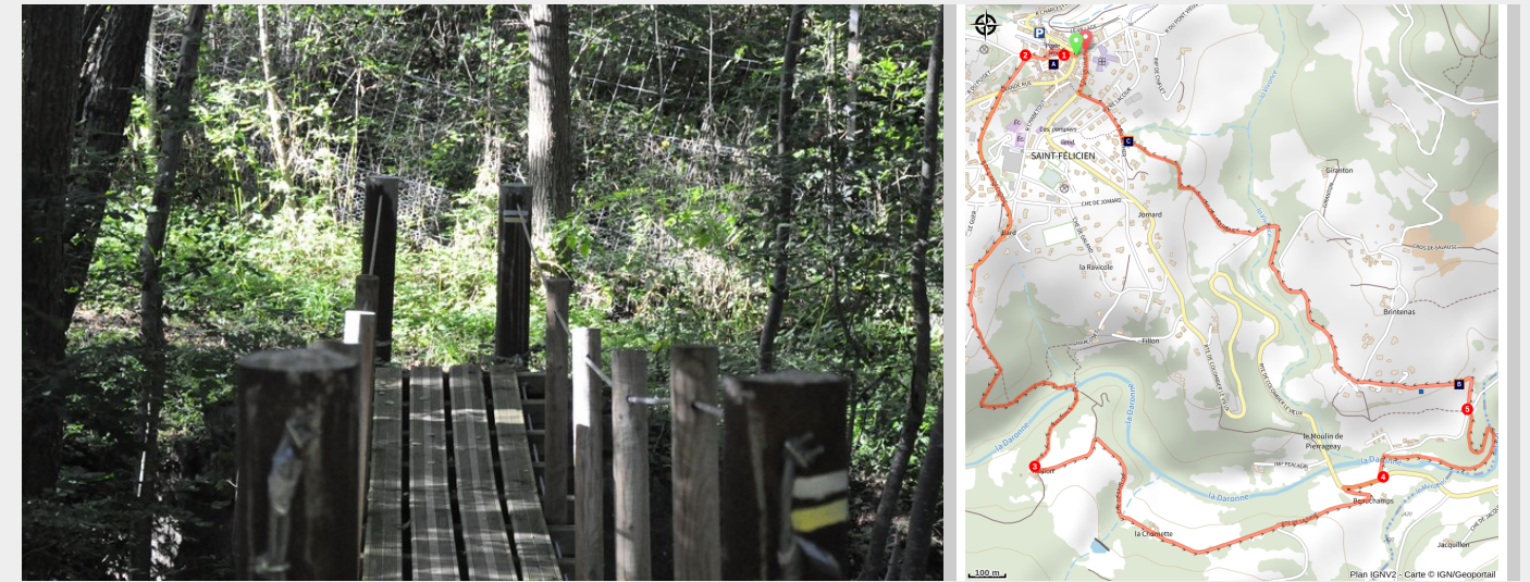
Passerelle de Raillon

A short walk that takes you to the Daronne valley and its suspended footbridge. You then pass by the arboretum along the campsite before going back up to Saint Félicien.