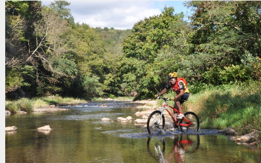
Traversée de rivière (Ardèche Hermitage Tourisme)