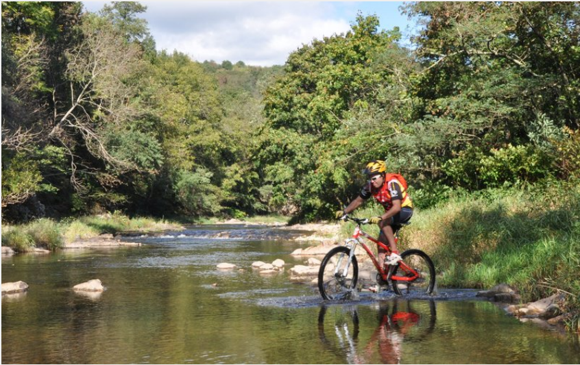
Traversée de rivière (Ardèche Hermitage Tourisme)