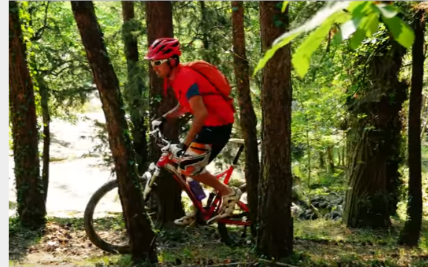
Sentier forestier (Ardèche Hermitage Tourisme)