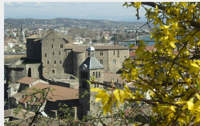
Château de Tournon (Ardèche Hermitage Tourisme)