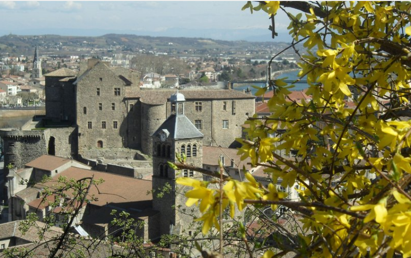
Château de Tournon (Ardèche Hermitage Tourisme)