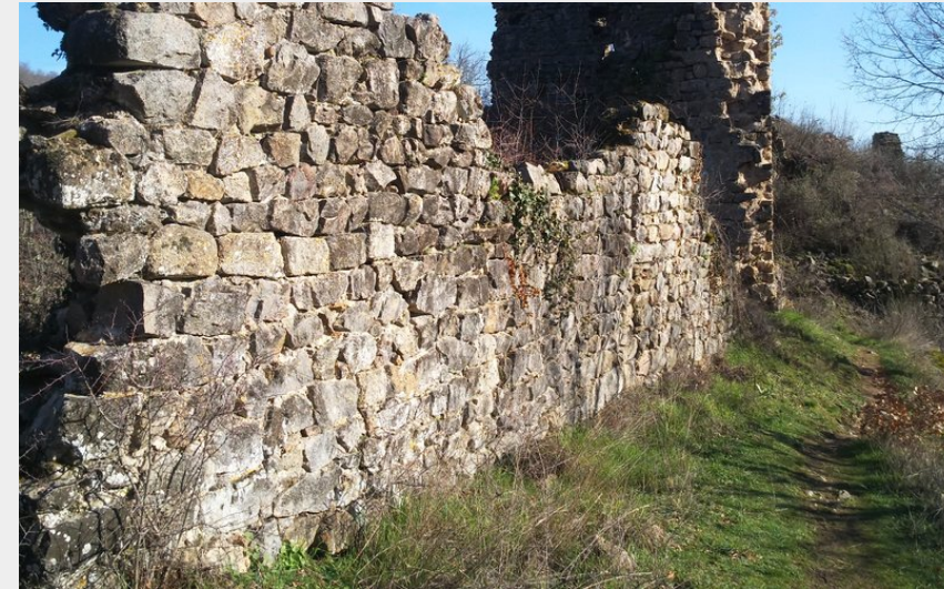
(Ardèche Sports Nature - Damien Deletraz)