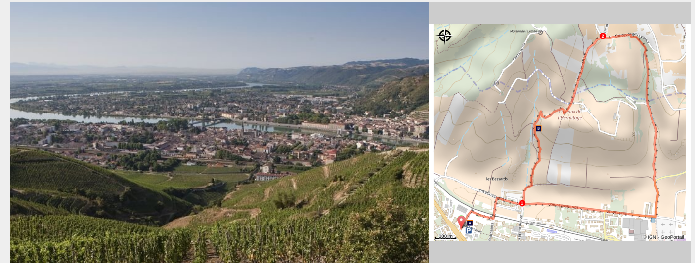
Vignoble de l'Hermitage

Beautiful views over the Rhône Valley and Vivarias hillsides.