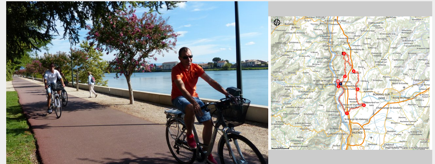
Voie verte le long du Rhône (Ardèche Hermitage Tourisme)