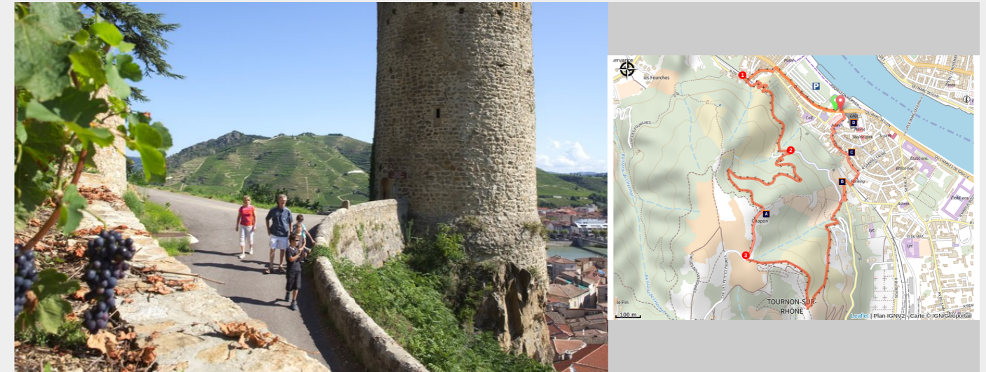
Tour au dessus de Tournon (Ardèche Hermitage Tourisme)

You will never tire of looking at the rooftops and impressive Rhône river and how they intertwine, as you walk up the hillside overlooking Tournon sur Rhône.