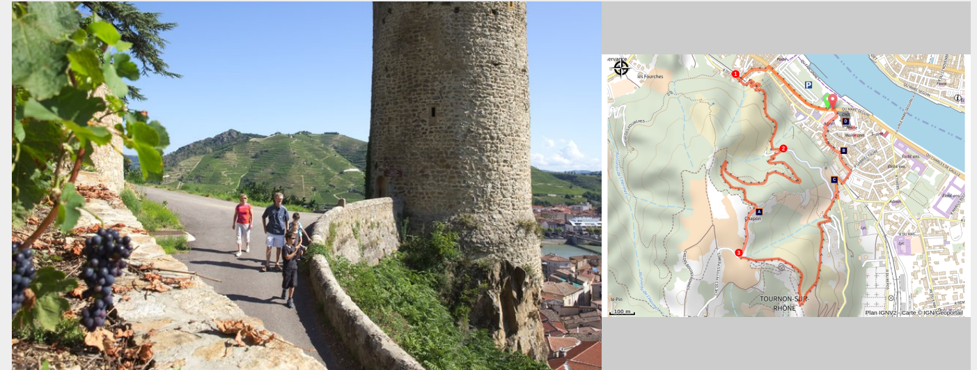
Tour au dessus de Tournon

You will never tire of looking at the rooftops and impressive Rhône river and how they intertwine, as you walk up the hillside overlooking Tournon sur Rhône.