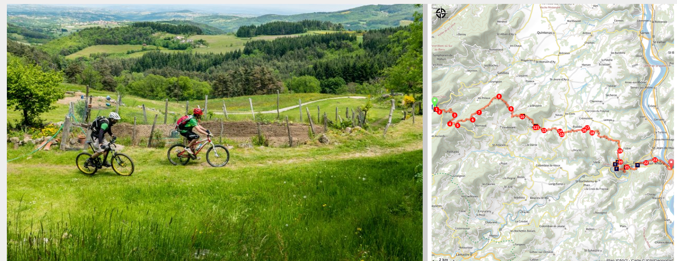
Sentier sous la Croix de Lyonnet

Quite an interesting trail through a lot of woodland. The route is divided into three sections : the first one in the forest, the second one through more agricultural land on the plateau and the final one overlooking the river Doux gorges and its scenery.