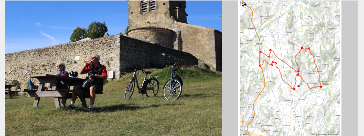
Prieuré Saint Andéol (Ardèche Hermitage Tourisme)

A beautiful scenic route, with the first part overlooking the Vercors mountain range, takes you to the charming church of Saint-Andéol then downward towards Saint-Donat with a favourite stopping point. The final section offers a bucolic atmosphere as you travel through truffle oak trees and agricultural land.