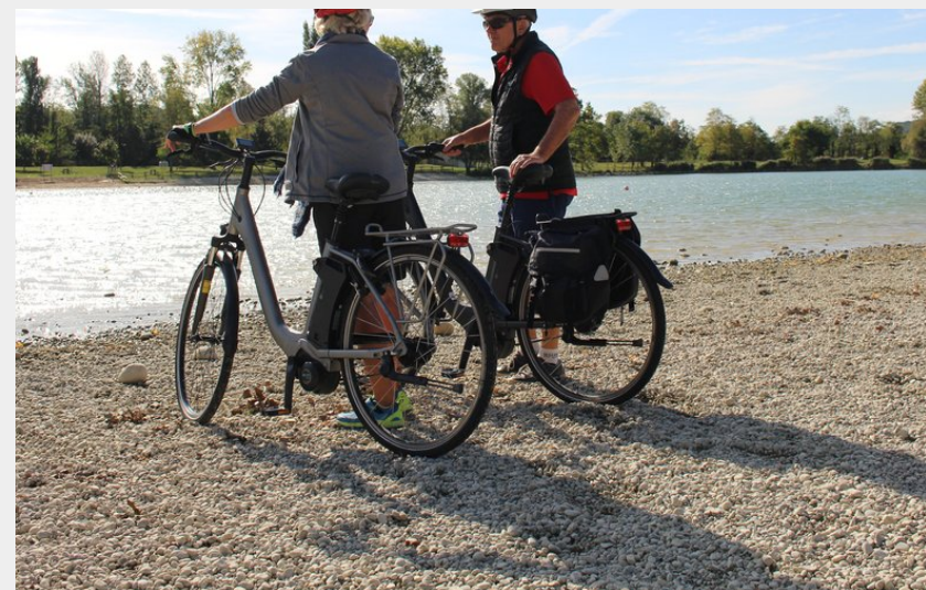
Lac de Champos