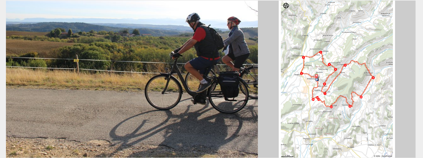
Route en balcon fesse au Vercors

On the secret and pleasant roads discover, round every bend, different landscapes, all with the same beauty. Here and there unexpected monuments worth the detour for contemplating.