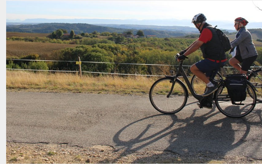
Route en balcon fesse au Vercors