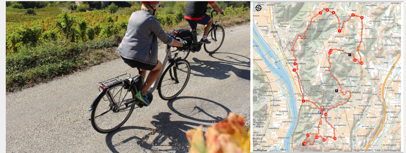
Route dans les vignes

In the heart of the famous vineyards hillsides climb a little to discover stunning views.