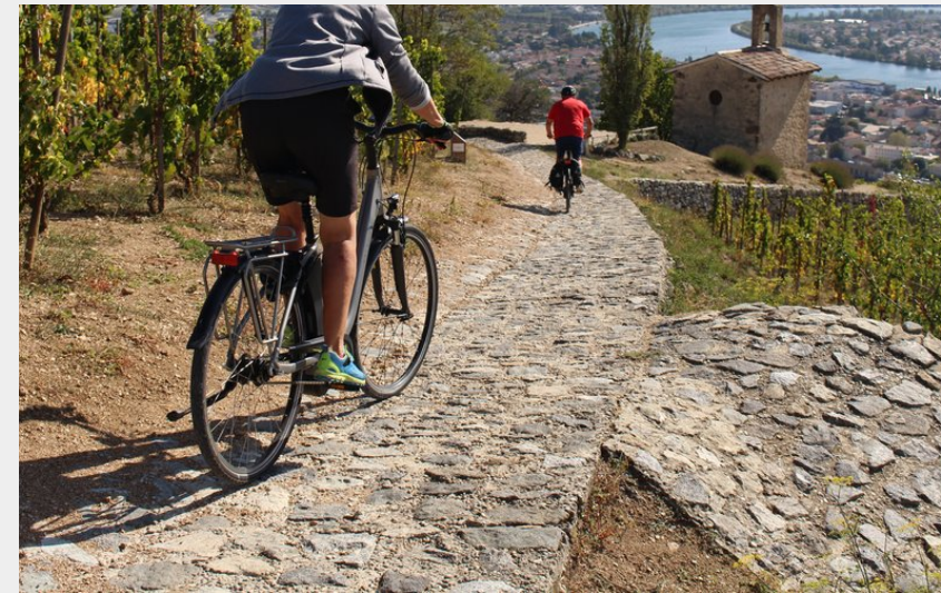
Chapelle de l'Hermitage