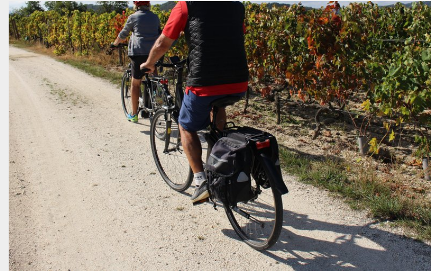
Chemin dans les vignes