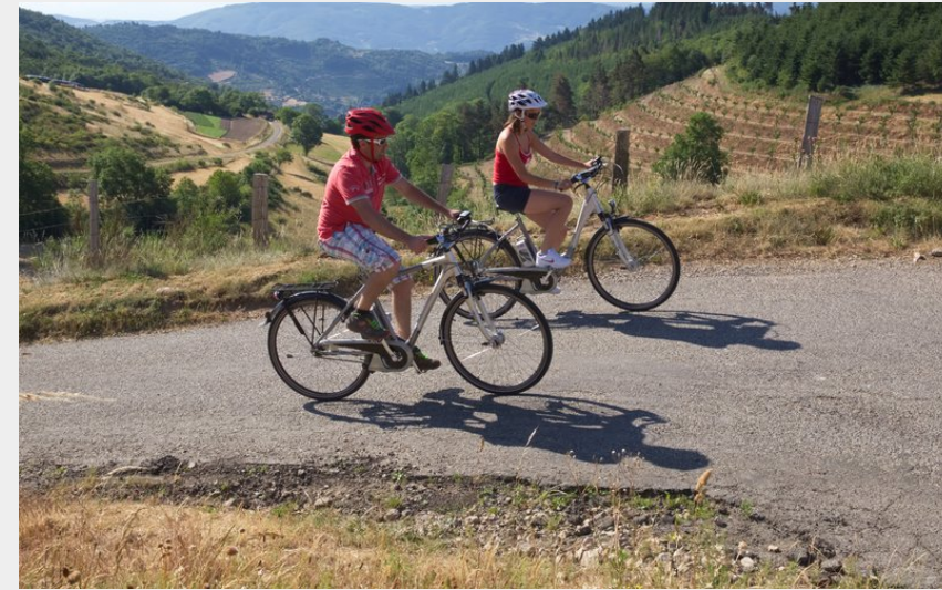
Passage au col de Fontfreyde (Ardèche Hermitage Tourisme)