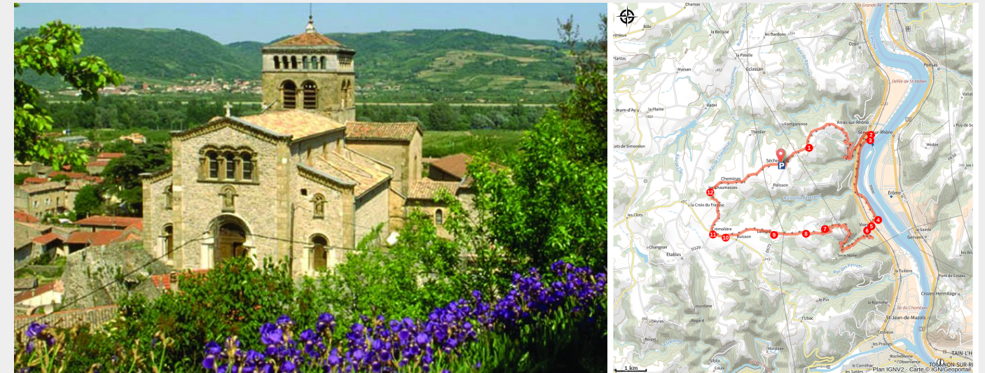
Eglise romane perchée de Vion (Ardèche Hermitage Tourisme)

A beautiful ride takes you down to Arras and its hilltop tower in the Rhône Valley before climbing a secret road to admire the Roman church in Vion.