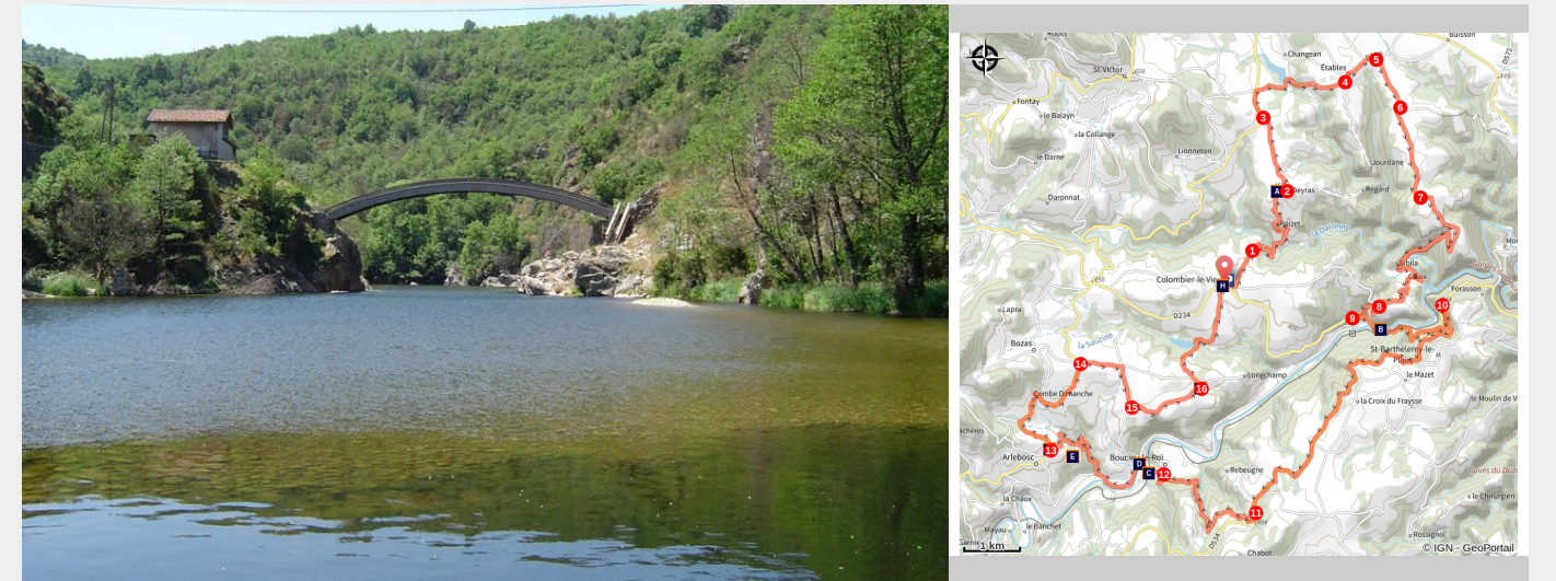
Confluence entre la Daronne et le Doux

Your battery will take a huge blow here. The short however constant uphill slopes will make you appreciate your motor. The landscape, between green land stretching before you and gorges below you, gives you a restful feeling.