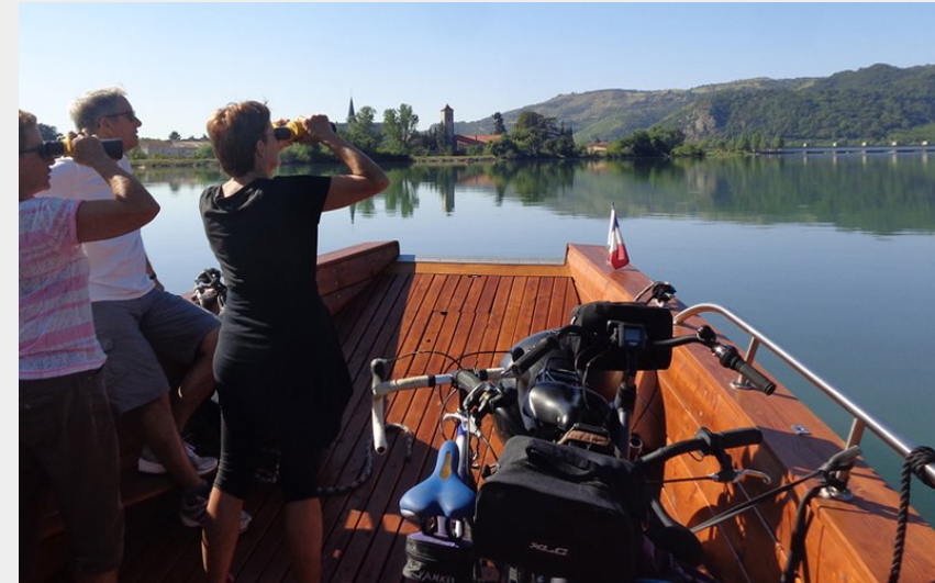
Croisière entre Saint Vallier et Tournon (Les Canotiers)