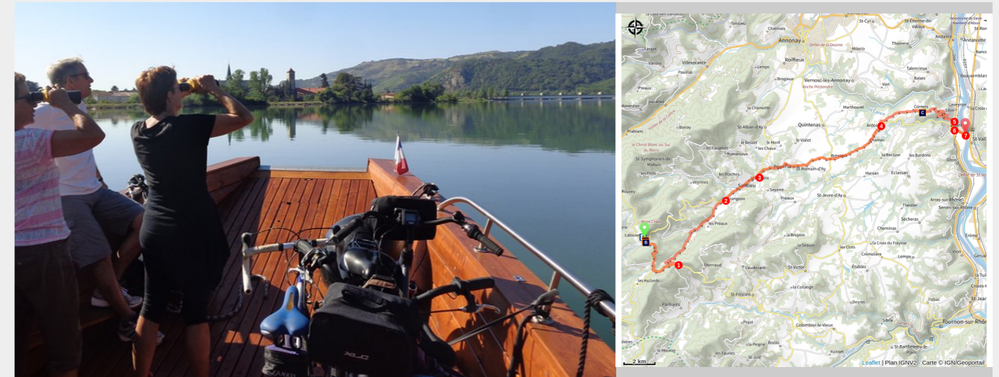
Croisière entre Saint Vallier et Tournon (Les Canotiers)

The e-bike is easy but careful downhill it can be pretty fast ! Why not be a little lazy for the uphill part and choose the bus along with your bicycle (only in summer). A way of getting to Lalouvesc and making the most of the journey down. Once in Saint-Vallier get on board the "Canotiers boat" (wooden boat) with your bike and enjoy a lovely cruise back to Tournon-sur-Rhône.