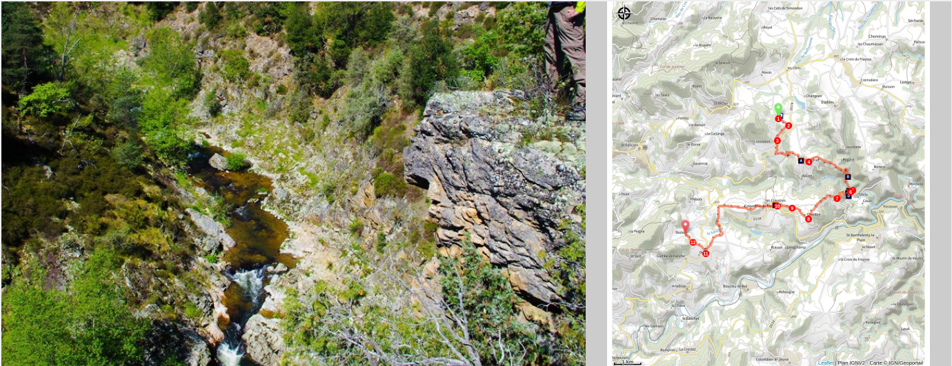
Gorges de la Daronne

The ramble starts at Corsas then going on to Deyras before plunging down into the atmosphere of the river Daronne gorges and Saint Sorny's chapel. The trail then takes you up to Colombier le Vieux then between orchards and fields onto Bozas.