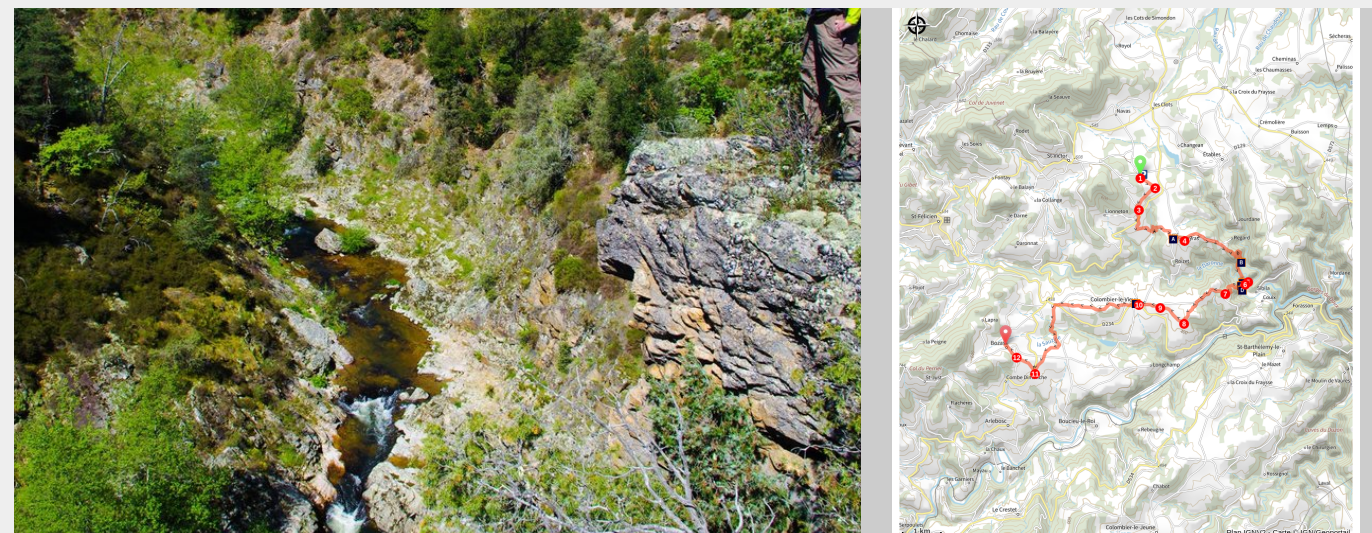
Gorges de la Daronne

The ramble starts at Corsas then going on to Deyras before plunging down into the atmosphere of the river Daronne gorges and Saint Sorny's chapel. The trail then takes you up to Colombier le Vieux then between orchards and fields onto Bozas.