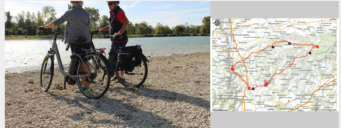
Pause au lac de Champos (arche-agglo-admin)

You can choose to do this trail over several days. Along the way discover all the features of hilly Drôme, including the most mysterious ones like : the panorama of the Alps and the untroubled dales offering very different and gentle landscapes along with its gourmet know-how or even the pebble, stone and rammed earth architecture.