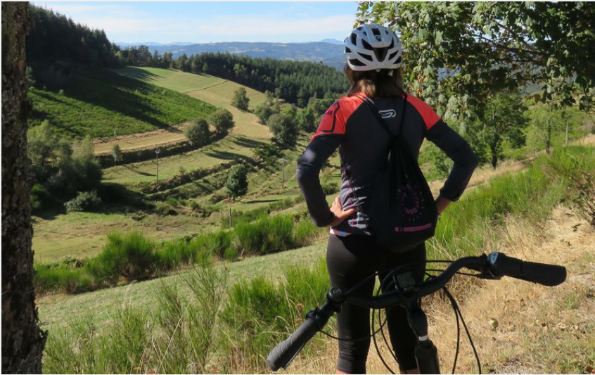
Panorama avant d'arriver sur Lalouvesc (ARG - ADT 07)