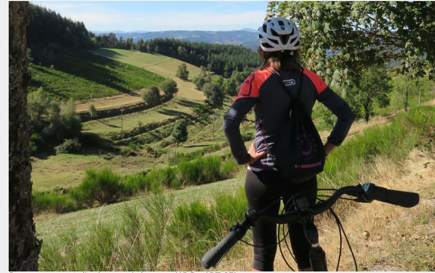
Panorama avant d'arriver sur Lalouvesc (ARG - ADT 07)